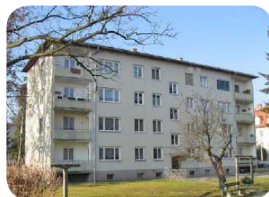
The Austrian pilot project