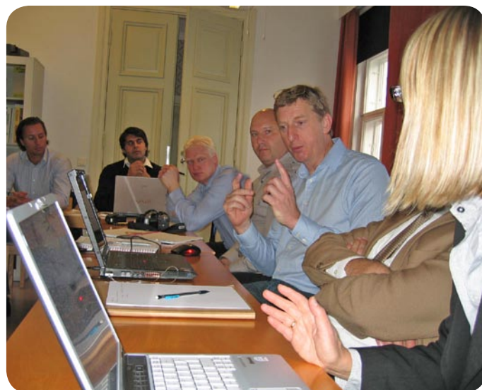
Joint workshop between the SQUARE project and the TRECO group

An interesting workshop was held together with the TRECO group, which is a network of social housing associations/owners. Activities and cooperation with the SQUARE project were discussed. TRECO members from the UK showed interest in adjusting the SQUARE QA system to UK conditions. To exchange experience from different pilot projects is another topic of interest for cooperation.