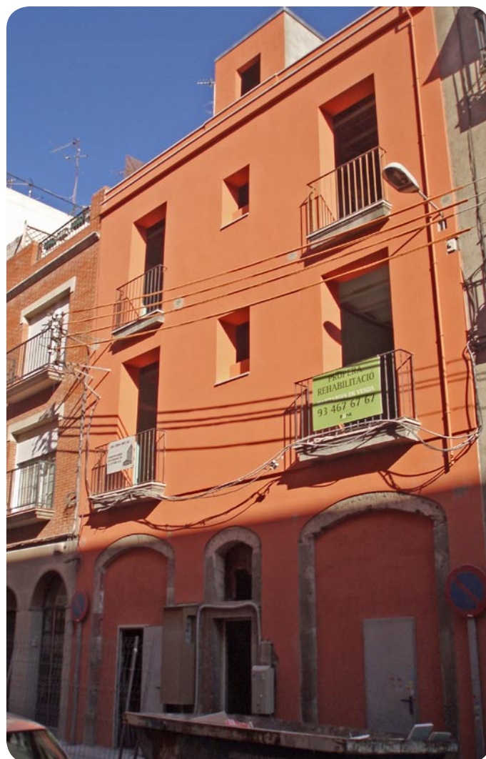
The Spanish pilot project