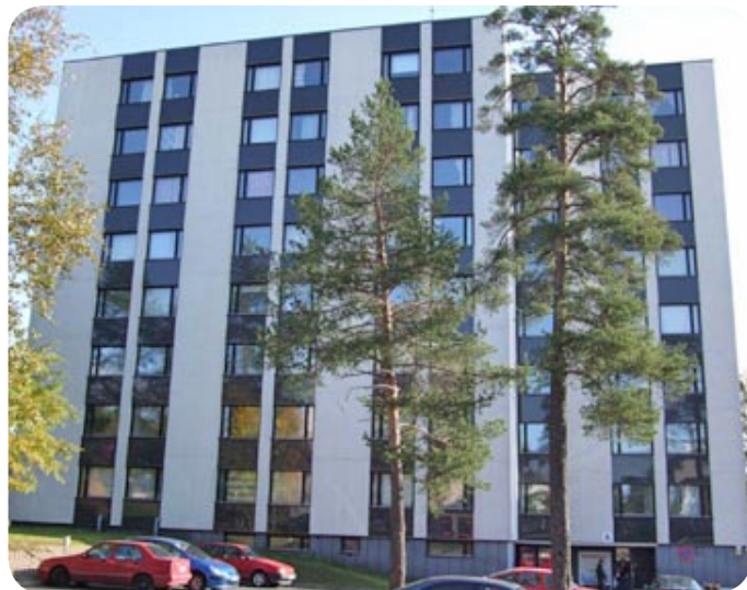
The Finnish pilot project

The participants also visited the Finnish pilot project that is about to be renovated. It consists of a student house with 33 apartments built in 1970. The goal of the renovation is to reach passive house standard level, which for northern Finland is 30 kWh/m 2 per year for heating energy.